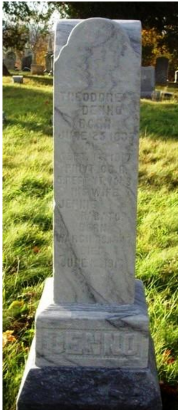
Denno monument, Sudbury Hill Cemetery, Vermont